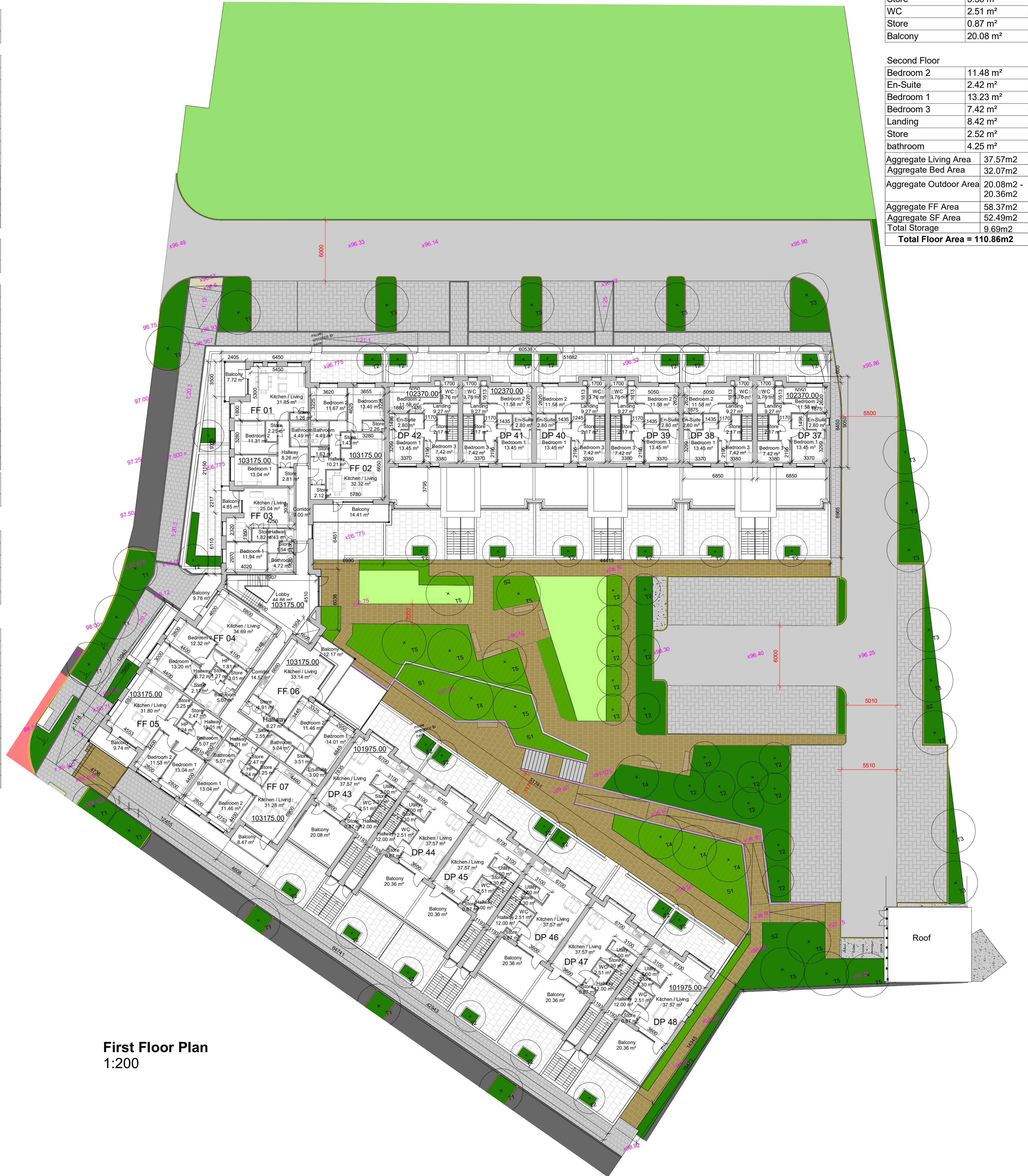
First Floor Plan 1:200